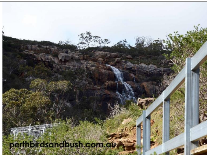
The Sixty Foot Falls in Banyowla Regional Park flow in late winter and spring