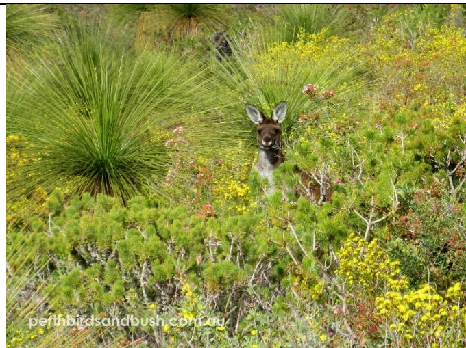
Western Grey Kangaroo among Wildflowers in Banyowla Regional Park