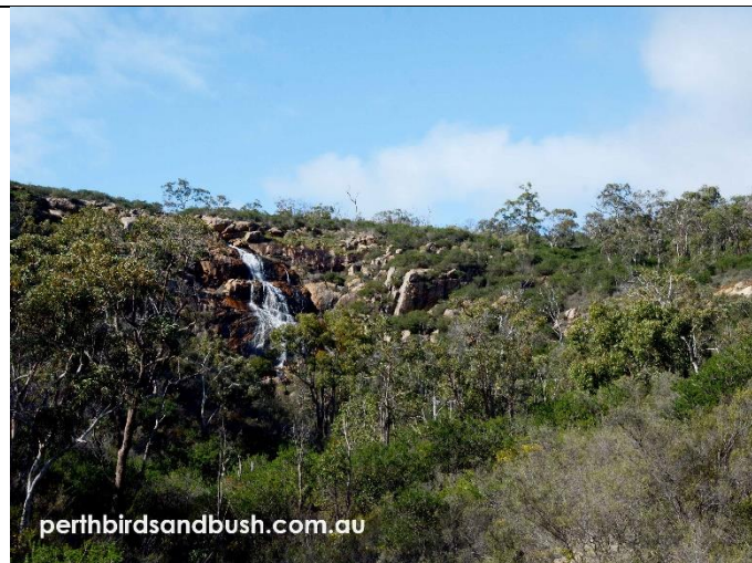
The beautiful Sixty Foot Falls in August 2018