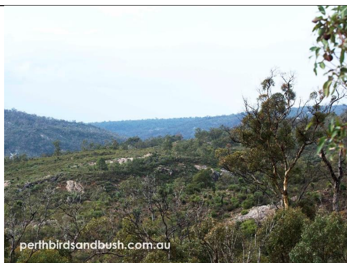
Views of the Perth Hills coming down the Zig Zag Scenic Drive