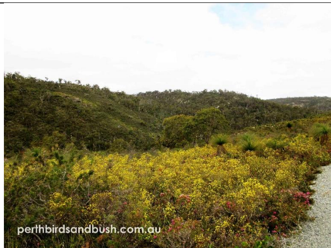
Stunning wildflowers at Banyowla Regional Park in October 2017!